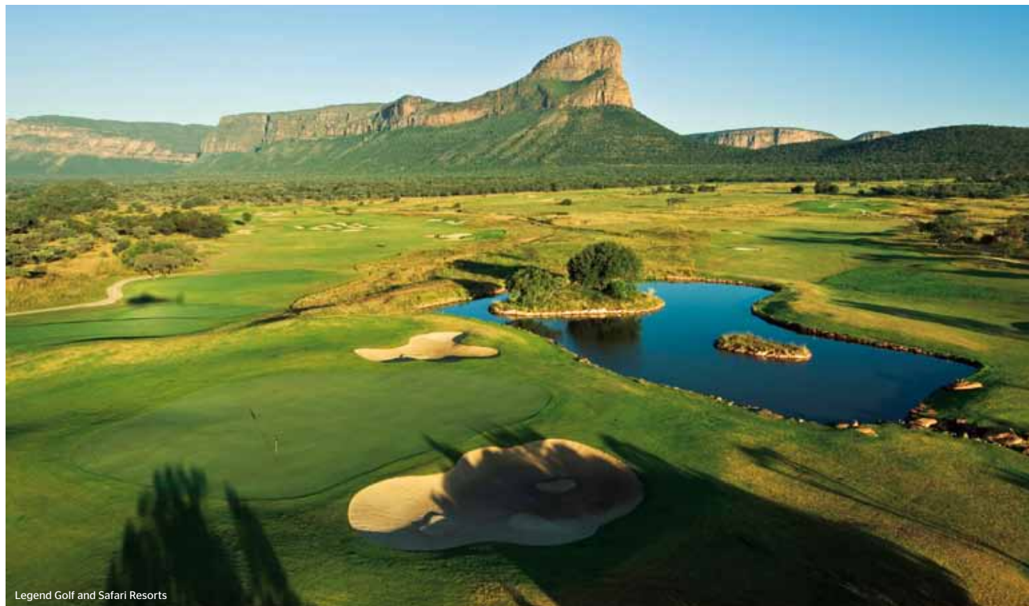
Legend Golf and Safari Resorts