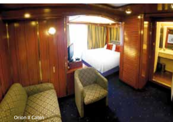
Orion II Cabin