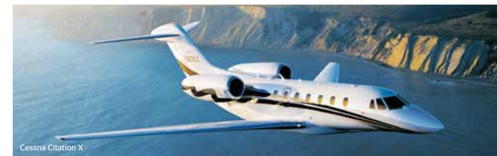
Cessna Citation X

powerful trajectory and high repulsion, allowing the ball to fly further with less effort. Should the luxury of time be one luxury you can't quite seem to muster, head to the golf course with the ultimate in transportation, your very own private jet. This will shave off a lot of time from your journey, allowing you the privilege of being able to play at more distant courses. Join the leagues of professional golfers like Davis Love III, who flies on a Cessna Citation X and you'll be able to head to more elusive golf courses that are far from major airports. These include the River Course at Blackwolf Run in Kohler, which is just a 10 minute drive to the first tee from the nearest airport, the Sheboygan County Memorial Airport. You can even consider opting for fractional ownership of a private jet, where US$400,000 can buy you about 50 hours of flight time with NetJets ( www.netjets.com ). INSPIRE