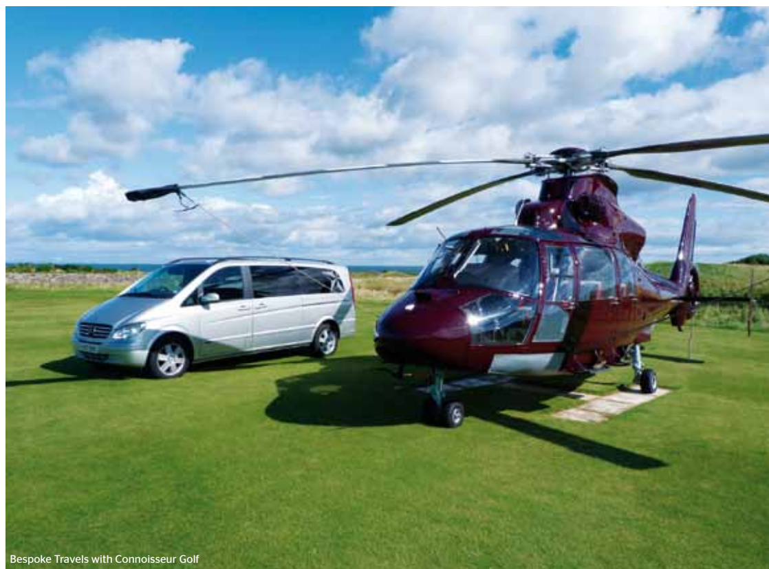
Bespoke Travels with Connoisseur Golf