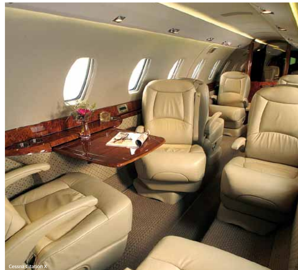
Cessna Citation X