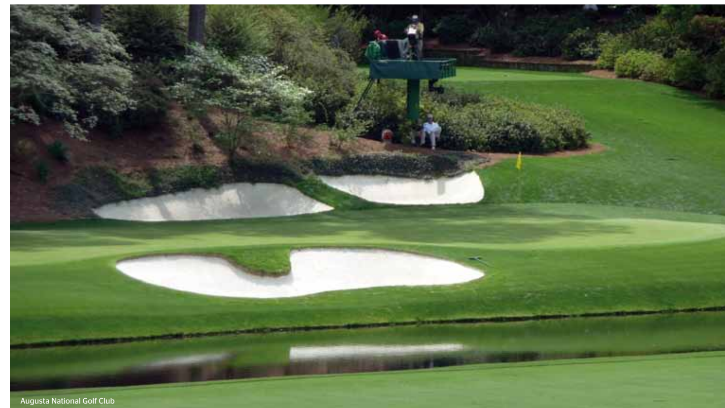
Augusta National Golf Club