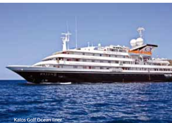
Kalos Golf Ocean liner