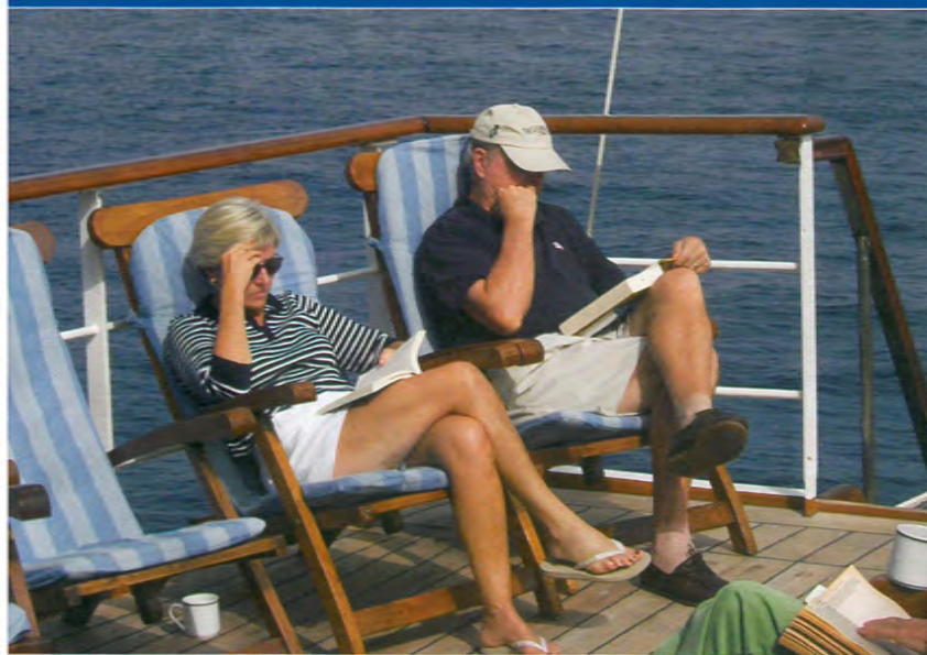
Bottom left and right: You may be on board a small yacht but the facilities are on par with the best hotels